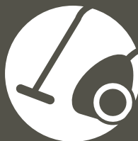
Easy to Maintain