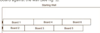
Fig. 3: Correct order for installation of first boards

Begin at the left hand end of the starting wall. Have a quantity of 3/8" (10mm) spacers handy. Begin with a full board. Saw off the tongue on both the long and short sides of the board, and place the board with the sawn butt end against the wall on the left, and the sawn long side facing the starting wall, but set out about two feet from the starting wall. Insert a spacer at the left end of the board and nudge the board against the wall (see fig. 3).